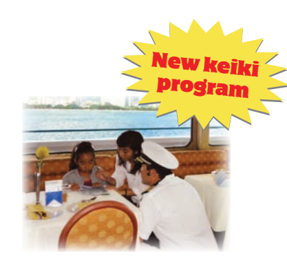
Keiki (Child) Program